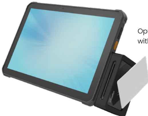
Optional Rotating Hand Strap with Payment Device Holder